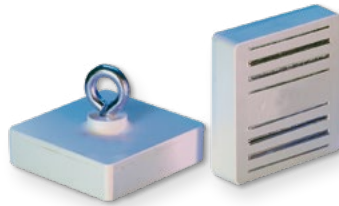
Type MO 10 - 01

Type MO 10 - 04 with internal thread M6, black.