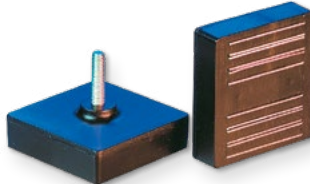
Type MO 10 - 03