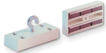
Type MO 10 - 02