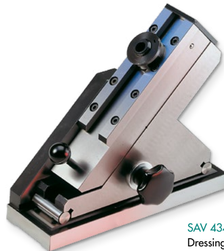
SAV 434.05 - 100 Dressing travel: 100 mm