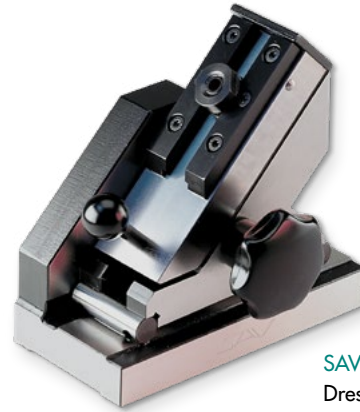
SAV 434.05 - 45 Dressing travel: 45 mm

The desired angle is adjusted with gauge blocks as per a supplied table (sinusoidal principle).