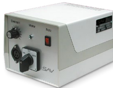
Control unit SAV 875.40 W x H x L = 170 x 140 x 230