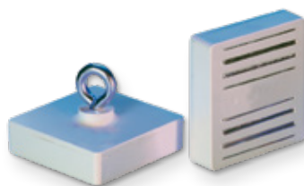
Type MO 10 - 01

Type MO 10 - 04 with internal thread M6, black.