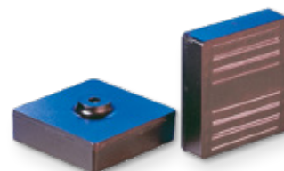
Type MO 10 - 04