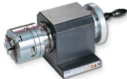
Size 200 with three-jaw chuck (accessory)