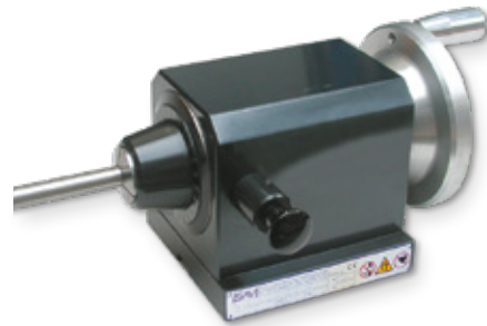
Size 100 with Deckel taper