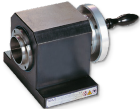
Size 200 with SK 40 taper